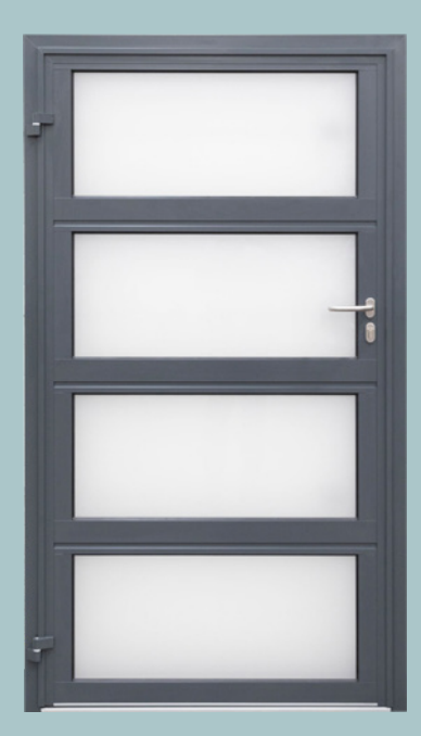
Matching side doors available.

Selecting the section colour and glazing type creates your door.